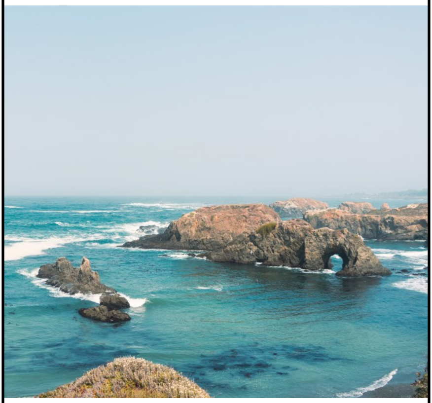
Albion, PAA Senior-Parent Campout, August 28, 2021

Sabbath Worship - September 4, 2021 A Place to Belong! A Place to Grow!