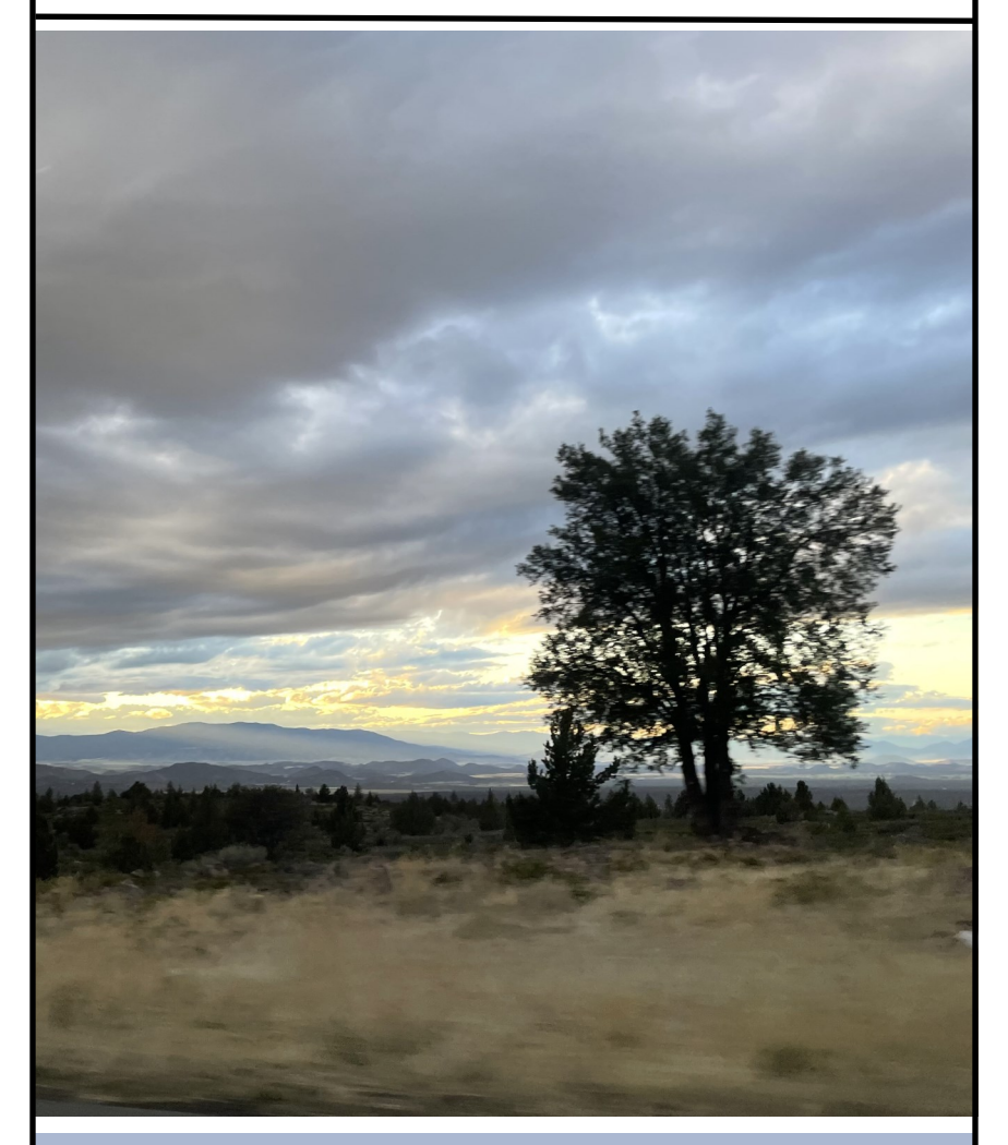
Sabbath Worship - October 23, 2021 A Place to Belong! A Place to Grow!