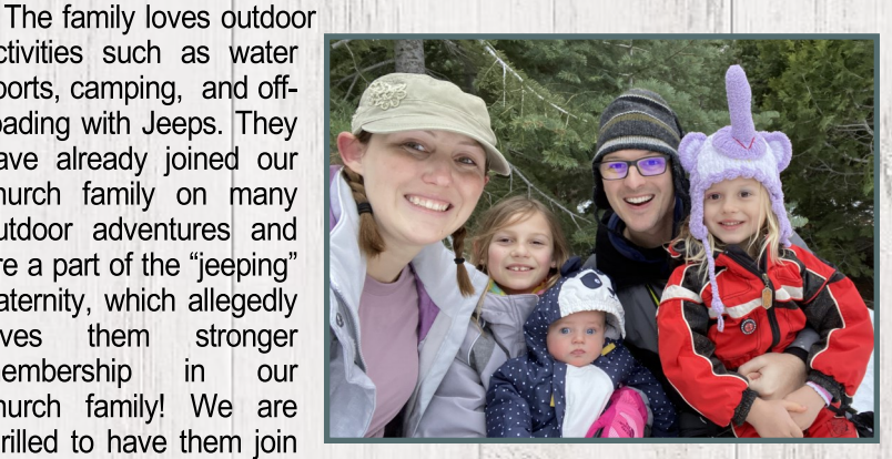
the PAC Family on whatever future adventures ahead!