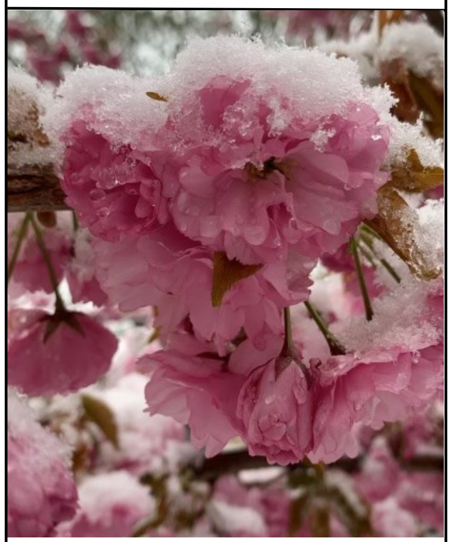
Sabbath Worship - April 23, 2022 A Place to Belong! A Place to Grow!