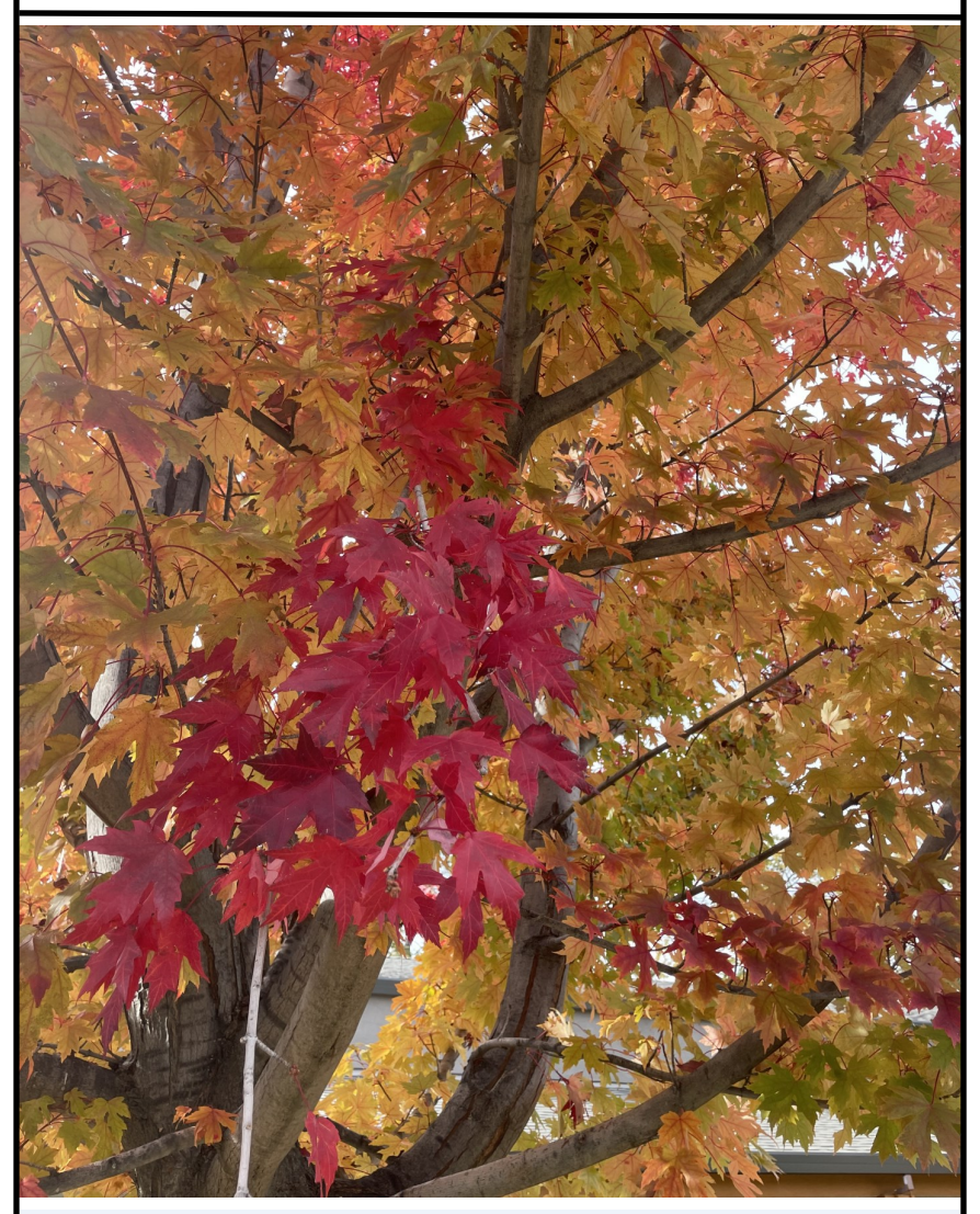
Sabbath Worship - November 19, 2022 A Place to Belong! A Place to Grow!