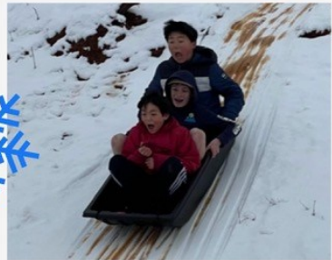
Spirit Week Fun! Has anyone seen our PAE teachers?