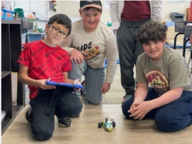
LEGO ROBOTICS with the 4-6 graders