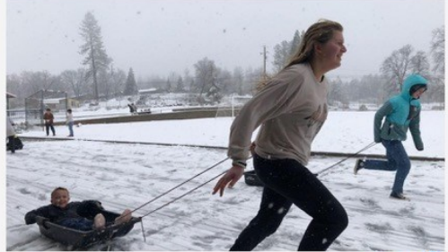
Studying components of snow and physics at PAE!