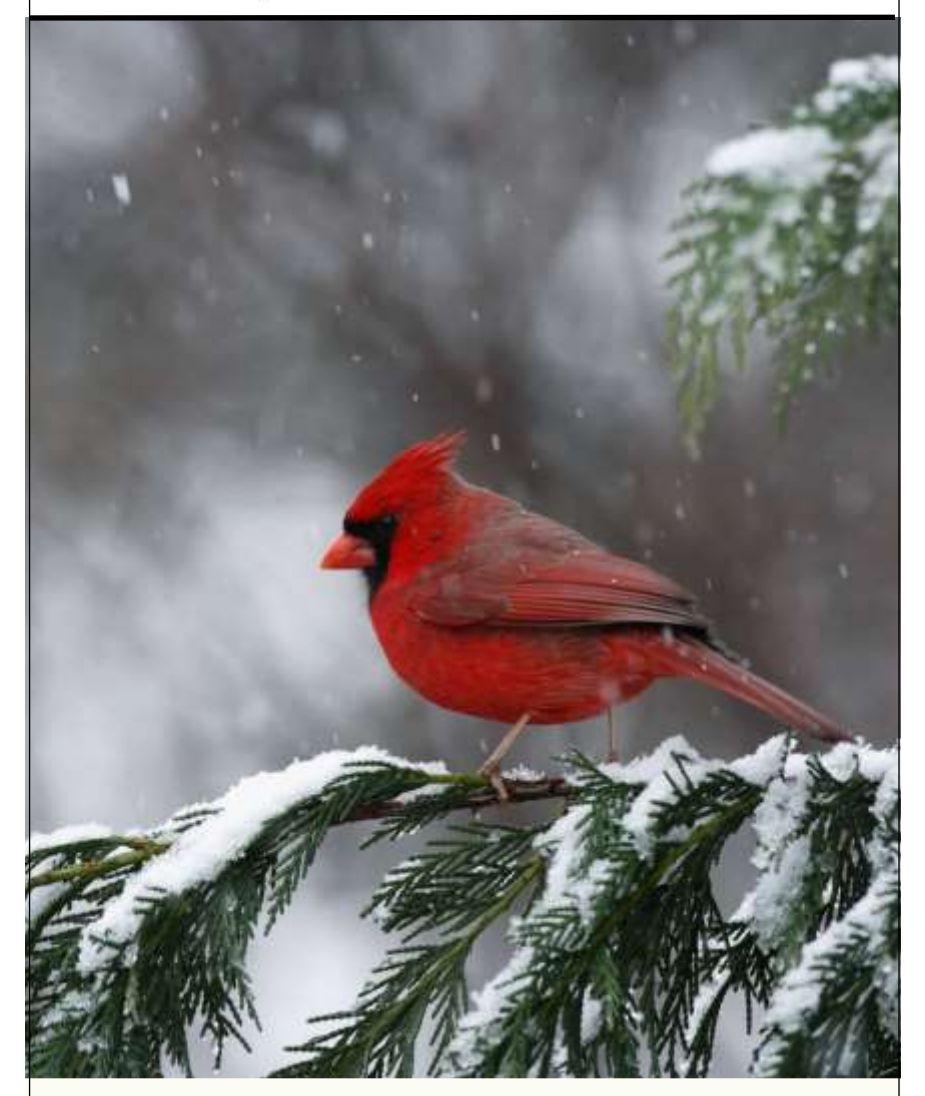
Sabbath Worship - January 27, 2024